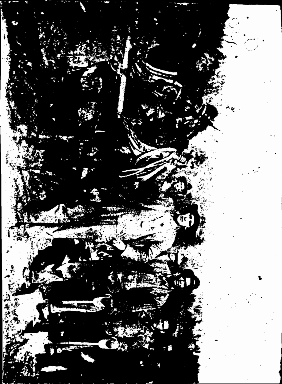
Arthur Bobbitt and road gang workers