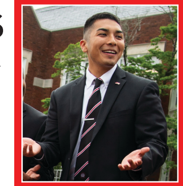
Meet SGA Officers PAGE 4