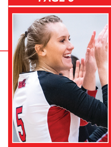
Volleyball picked no. 4 over all PAGE 8