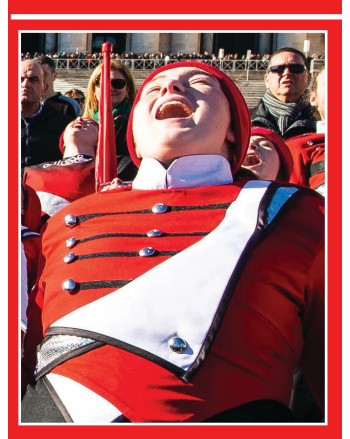
Southerners are back at it again PAGE 5