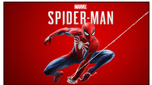
New Spider-Man game swings to success Page 5