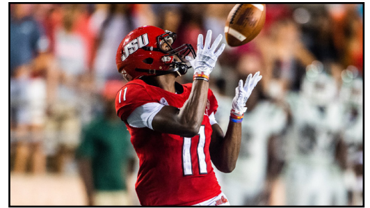
JSU puts up 71 points against MVSU Page 7