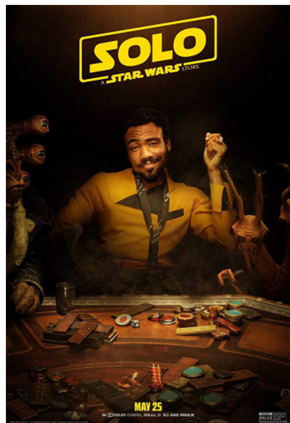
Donald Glover as Lando Calrissian

After an uninspiring performance at the box office, Solo: A Star Wars Story released on Blu-Ray and digital in late September.