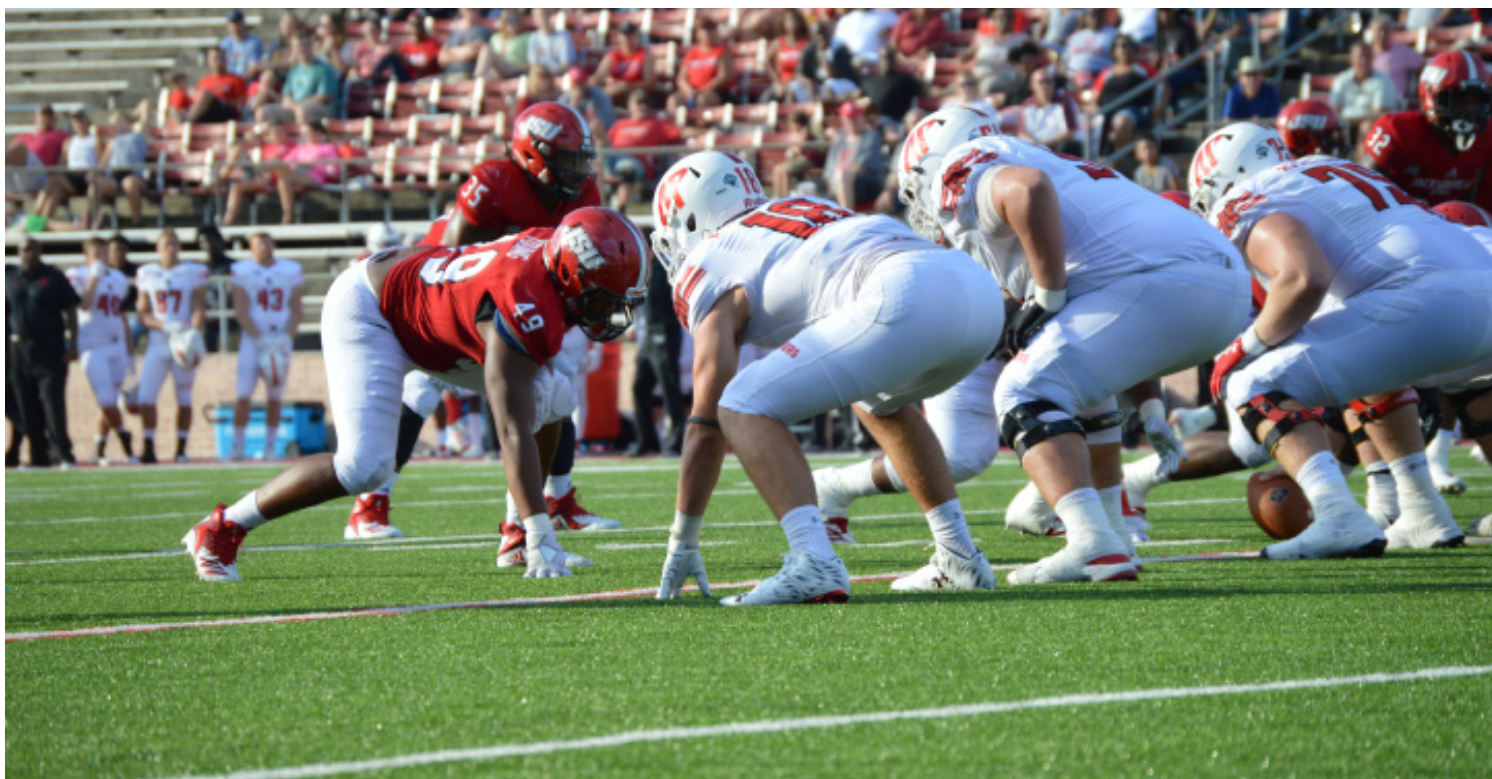
Sydney Sorrells Sports Photographer