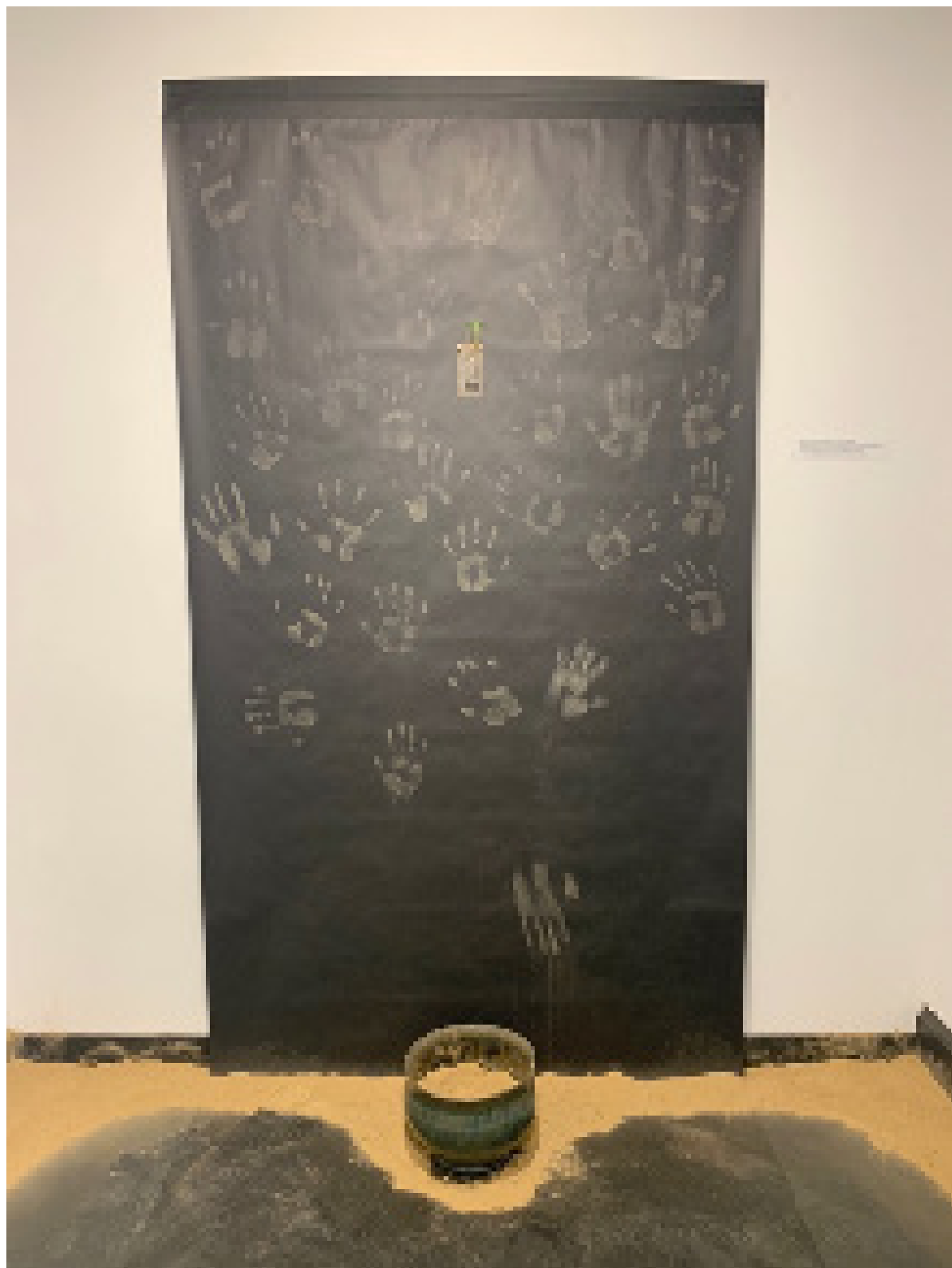
Sydney Spencer/The Chanticleer

The motivations for every single character make little to no sense. The main bad symbiote, Riot, travels for most of the movie only to end up where he would of