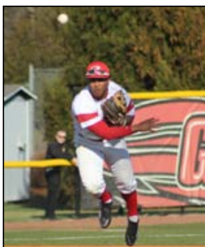
Jacksonville State's baseball team boasts back-to-back season opener wins. The Gamecocks topped the Valparaiso Crusaders 9-3 on Friday Feb. 21.