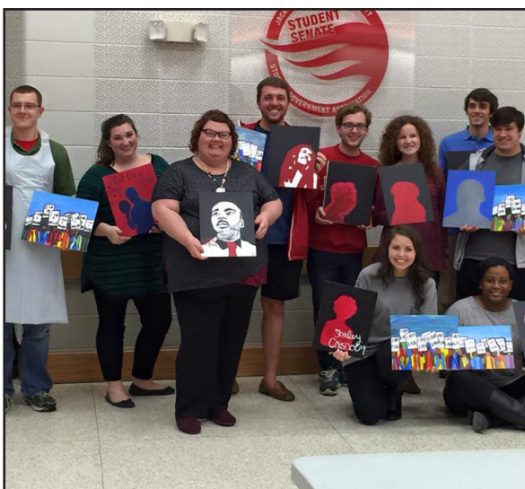
Photo Left: After listening to Andromeda, participants of the Cultural Canvas Painting hold up their finished products. Photo Right: The participants from Tuesday's event work on their silhouettes of civil rights activists and locations. The Cultural Canvas Painting in the TMB had a great turn out. SGA members are seated at the front table.

At the end of the day, everyone in attendance took their works of art and a bit of knowledge home with them.