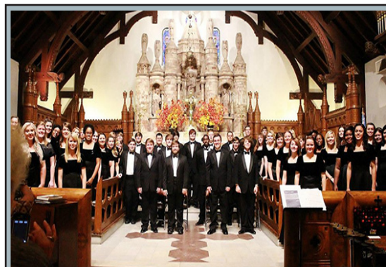
The JSU A Cappella Choir at the Church of St. Michael and All Angels in Anniston, AL