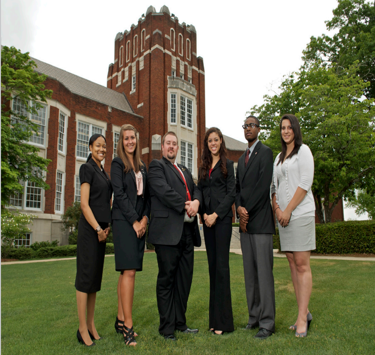
JSU Photo Database