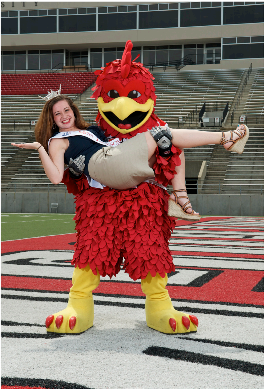
JSU Photo Database

"People get touchy—they say, 'Oh, she's just a pageant girl,' but it's so much more than that. It's a scholarship opportunity," she said.