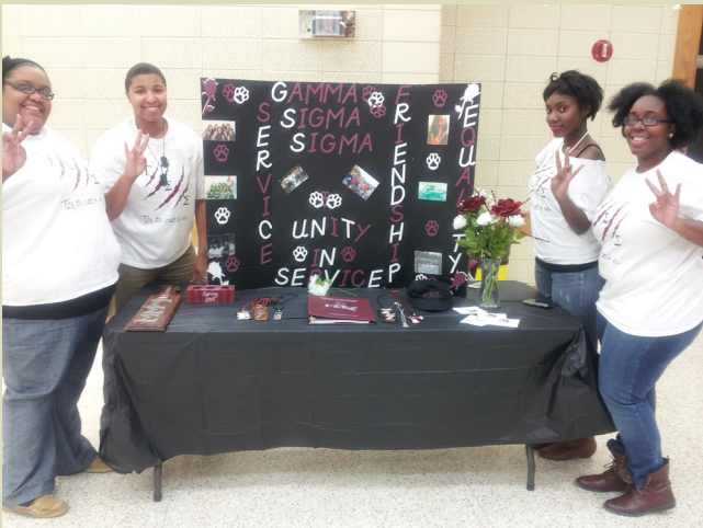
Gamma Sigma Sigma was one of the many organizations who came out for the SGA sponsored event “A Day of Unity.”