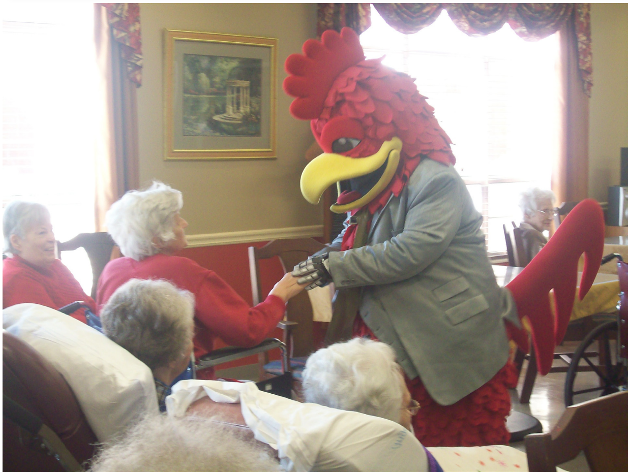
Above: Cocky greets the lovely ladies that reside at Piedmont Health Care.