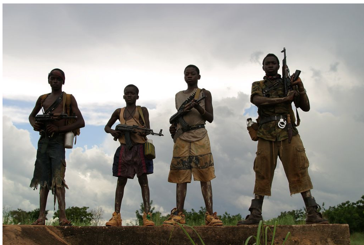
Young children are taken from their families and forced to be part of the LRA led by Joseph Kony.