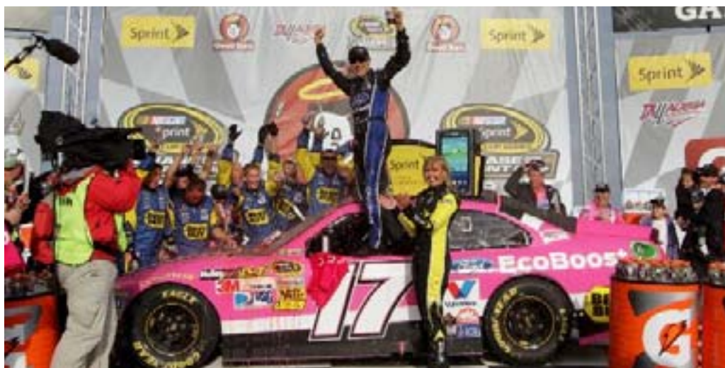
Matt Kenseth celebrating in victory lane alongside his pink Roush-Fenway Ford

Chase driver Greg Biffle was sixth, followed by points leader Brad Keselowski.