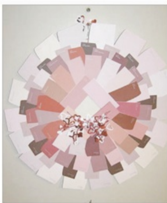
ABOVE: Paint Sampler Valentine Wreath instructions at PopularMechanics.com

No matter how you decide to spend your day, be sure to keep in mind the true meaning of the holiday. Valentine's Day is meant to show those that are important to you just how important they are. So make someone's day. Give a gift, share a hug or say those quintessential three little words.