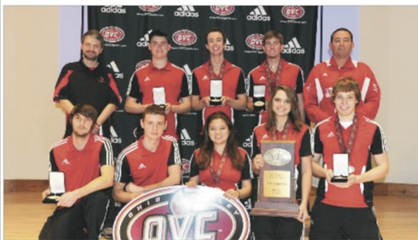
The JSU rifle team program celebrates its sixth OVC championship defeating Murray State.

JSU has four remaining OVC games that will determine if they make the OVC Tournament or not.