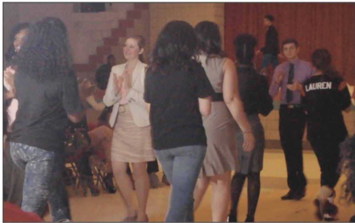
WALK: Students strut down the runway at the B.L.U.E. Print Fashion show, last Thursday.