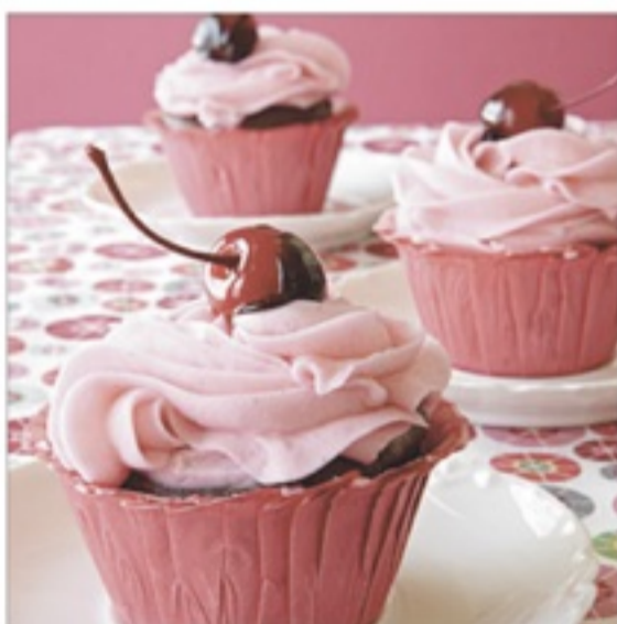
BELOW: First Kiss Cupcakes