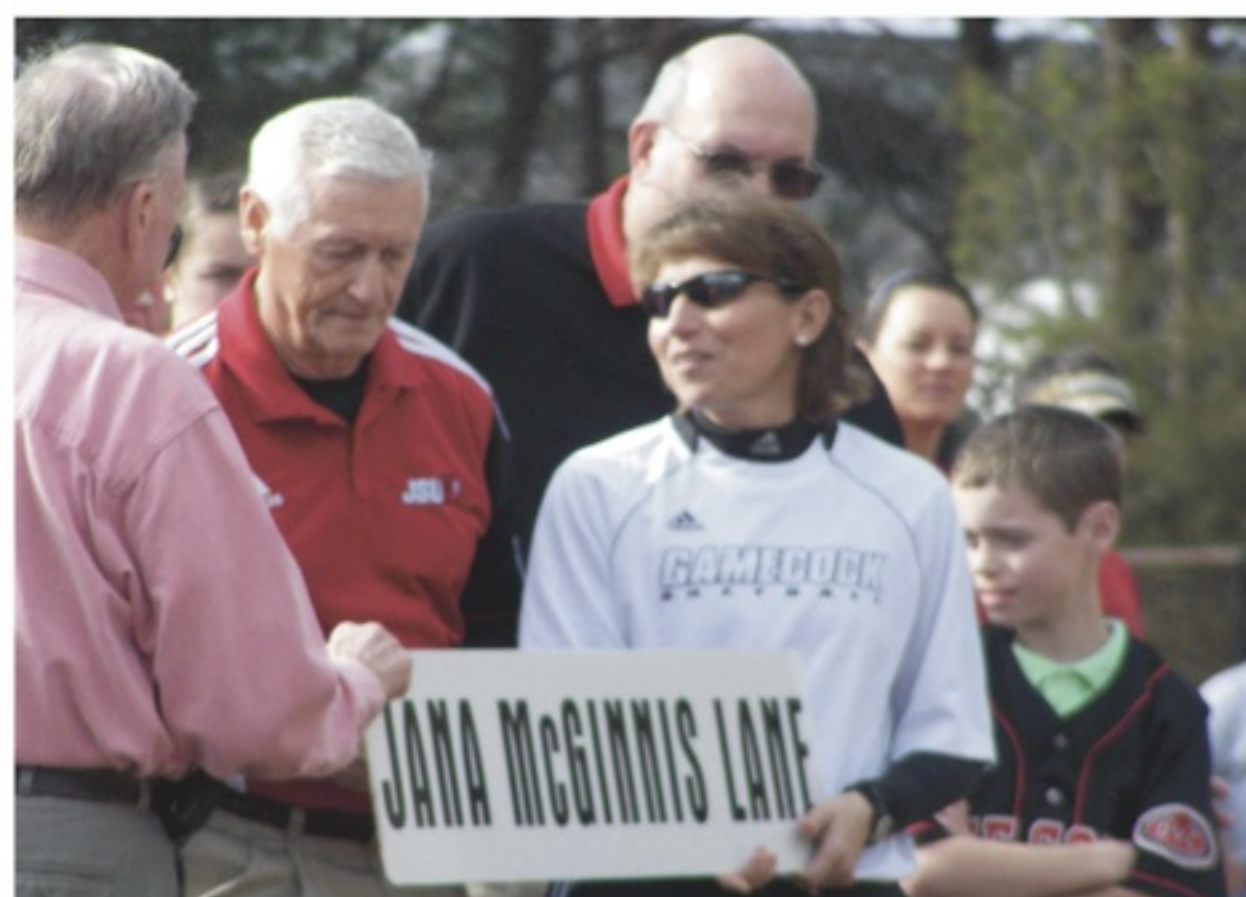
Rudy Abbott Highway was renamed to Jana McGinnis Lane this past weekend.