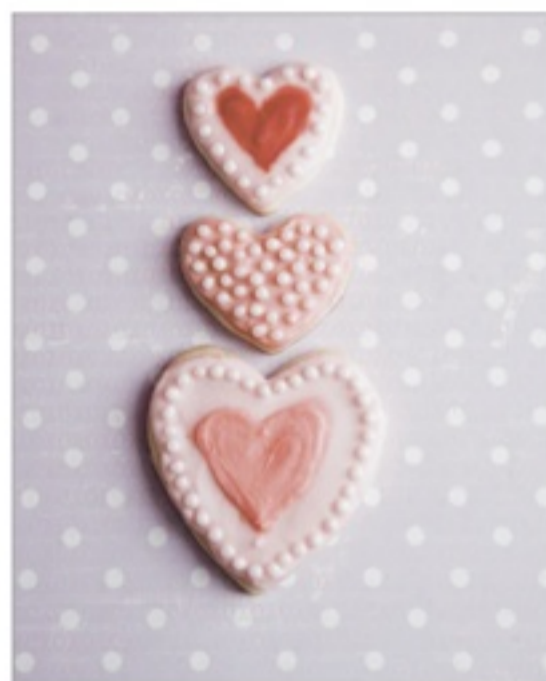
TOP: Bacon bouquet tutorial at Squidoo.com