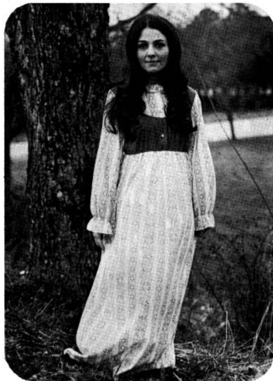
Miss Jax State

The schedule of the team will be published in this paper as soon as the schedule is made available to this party.