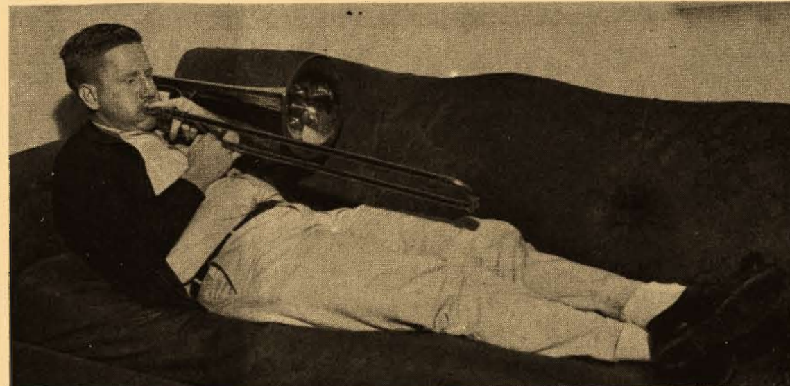
JIM OF THE MOUNTAIN

Section 1. Organization of the Student Government Association: The Student Government As-