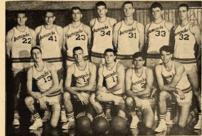
JAX STATE COLLEGE BASKETBALL TEAM

Let's pause at this time of joy and expectation — and take time to seek out the true meanings of this happy holiday.