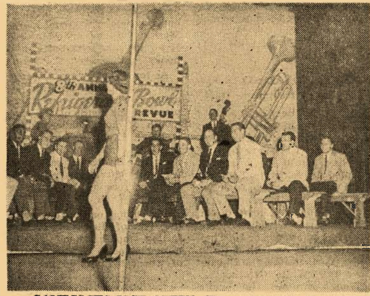
GAMECOCKS PICK QUEEN—Players from the University of Rhode Island and Jacksonville select a Refrigerator Bowl Queen.