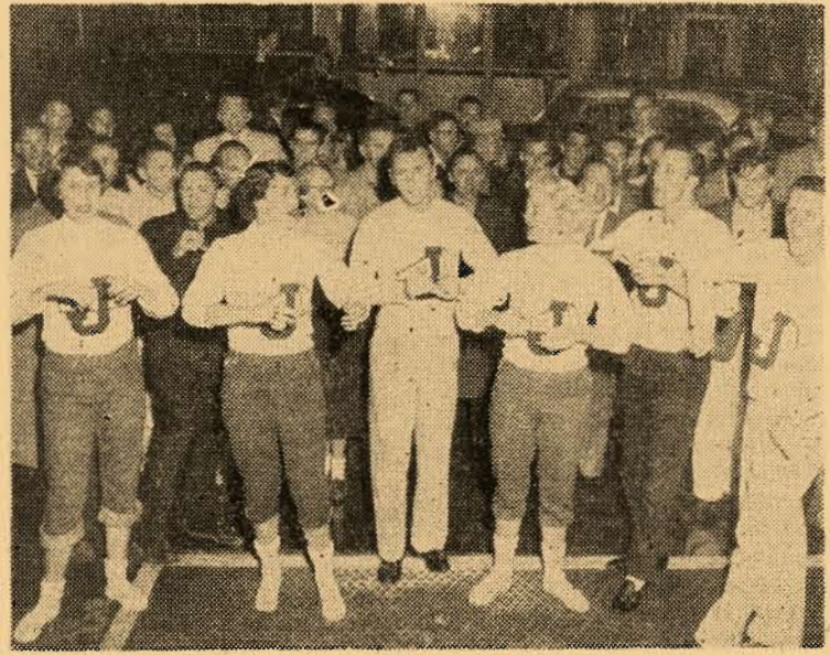
PEP RALLY—J. S. C. students and other Gamecock supporters hold a pep rally in front of Vendome Hotel in Evans-ville, Ind. The temperature was low, spirits high.