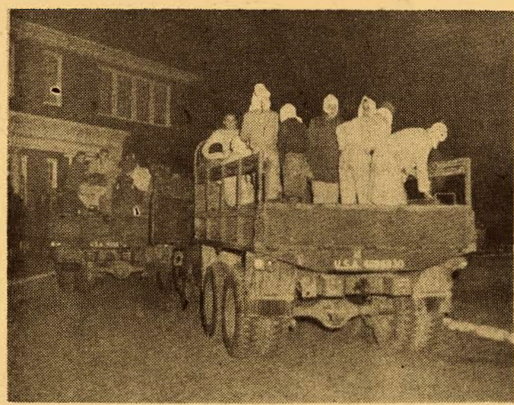
J. S. C. SEARCH PARTY — Late in the night of November 29th word came from Gadsden that a small boy was lost in the woods. The child had been gone for several hours, and the weather was below freezing. The male students of Jacksonville quickly turned out to aid the search. However, just as the Jacksonville group arrived, the child was found and was in good condition.