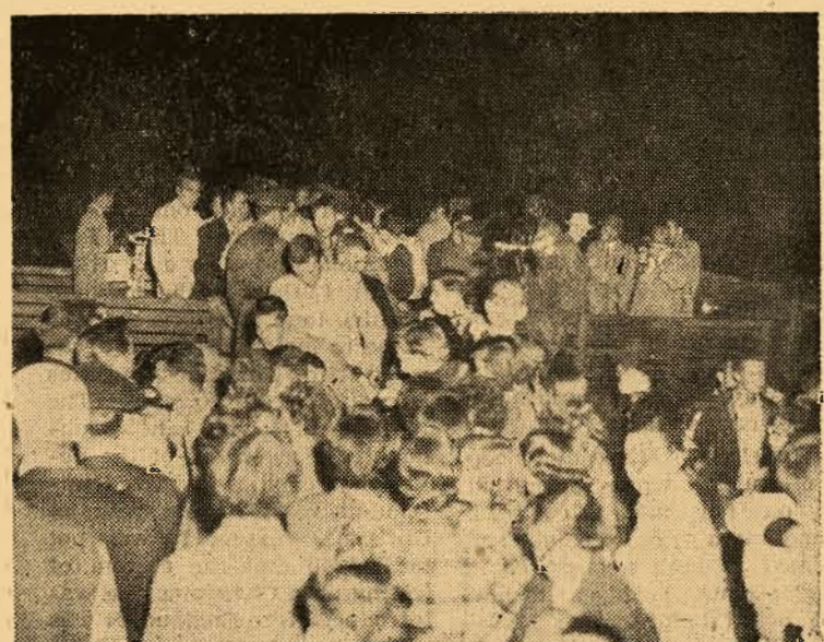
GAMECOCKS GREETED—A huge crowd of some 7,000 people greeted the Jacksonville players when they arrived back home.