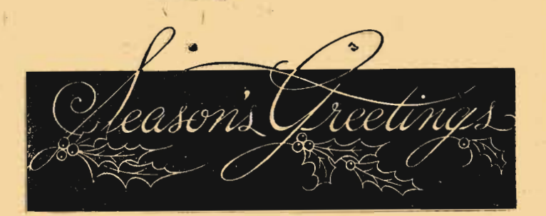
From The Collegian Staff