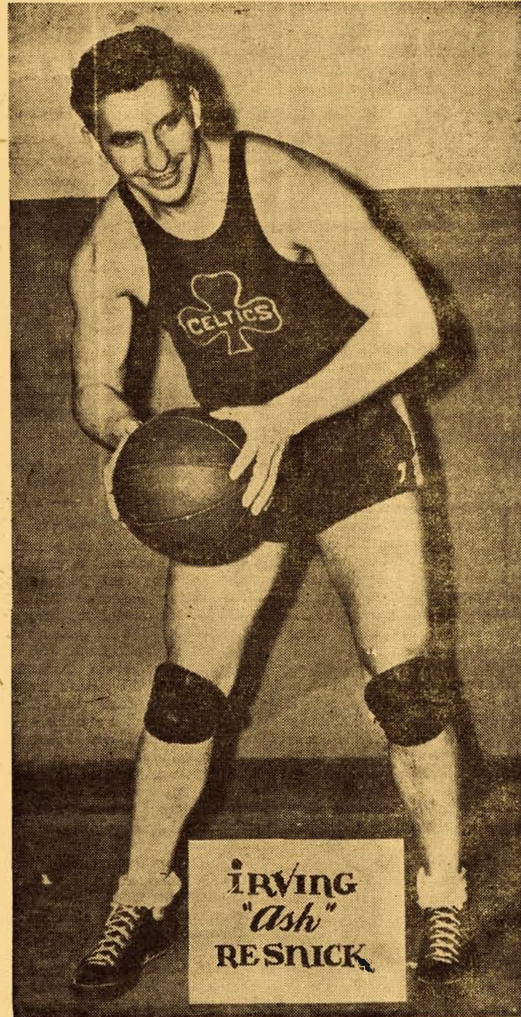
"THAT MAN IS HERE AGAIN"

At least five key men are lost from last year's championship